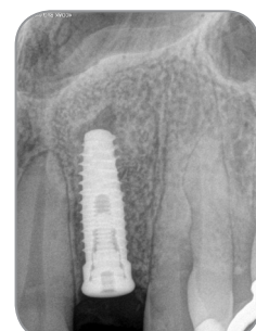
Final Implant Placement