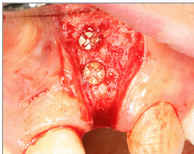
Reentry At 5 Months Post-GBR