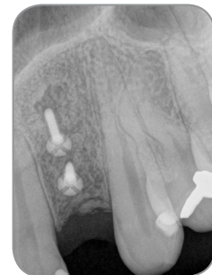
5 Month Post-Op Scan