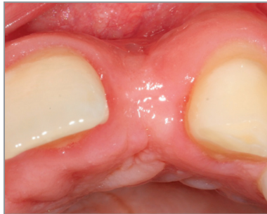
Deficient Ridge Width