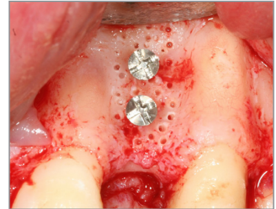
Site Decorticated Tenting Screws Placed